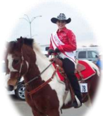
2010 District One Queen

Cedar Hill, Joshua, Midlothian, Rusty Spur