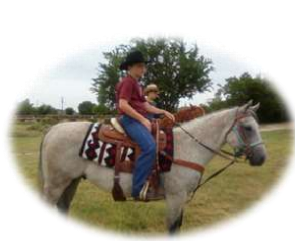
2010 District One Wrangler