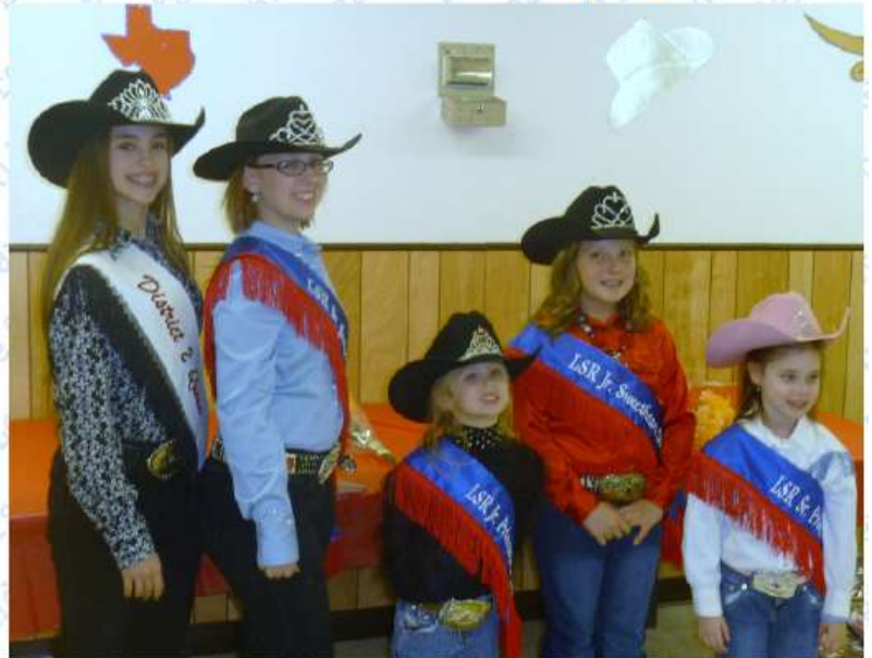
PeeWee and Intermediate winners